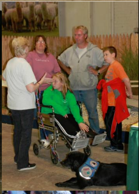
Big E & National